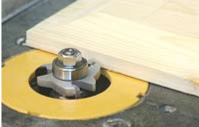
The back cutter bit makes fitting the panel to the stile grooves easy without affecting the presentation face of the raised panel.

Cut away the waste material with a band saw or jigsaw staying 1/8" to 1/16" from the template. Install the Infinity flush trim bit, adjusted as described for the top rail and finish shaping the top of the raised panel. Remember to watch the grain as a climb cut may be necessary on the first half of the template where the arch sweeps upward, very often against the grain.