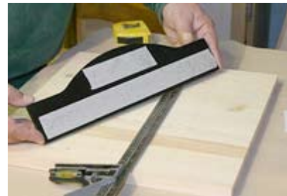
Use plenty of double-sided tape to insure the template does not move during routing!