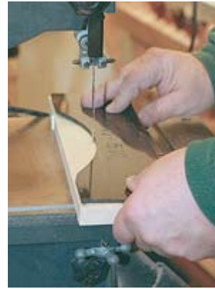
Sawing the waste away very close to the template makes it easier for the flush-trim bit to clean the edge up.

Subtract 3/16" from the overall height and width measurements to insure there will be a minimum 1/16" free space on all four sides of the finished panel to allow for expansion and contraction.